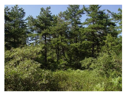
Pitch pine scrub oak barren

How to check for FECV. The SFI State Implementation Committee has worked with MNAP and MDIFW to create a process for determining if a wood source area supports an FECV. The process is intended to help get this information without making the specific locations of these sensitive features publicly available, as they may otherwise be vulnerable to collection or other harm. When planning a timber harvest, road-building, or other activity that may disturb a site, include going to the SFI FECV website <a href="https://sfimaine/forests-of-exceptional-conservation-value-fecvs/">https://sfimaine/forests-of-exceptional-conservation-value-fecvs/</a> for quick pre-check. This website includes links to a list of towns with documented FECV, a zoomable map of FECV approximate locations in towns and a video explaining this process live.