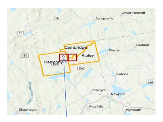
Operations area is INSIDE the RED FECV polygon.