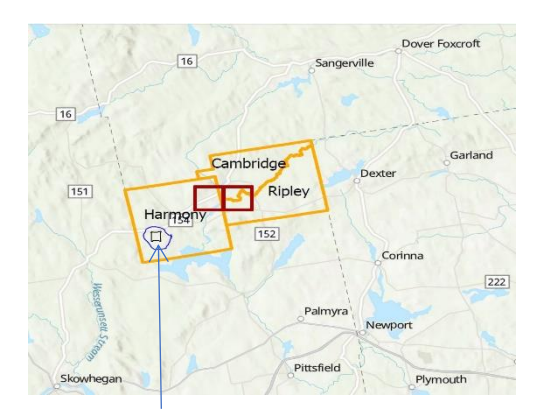
Operations area is OUTSIDE the RED FECV polygon.